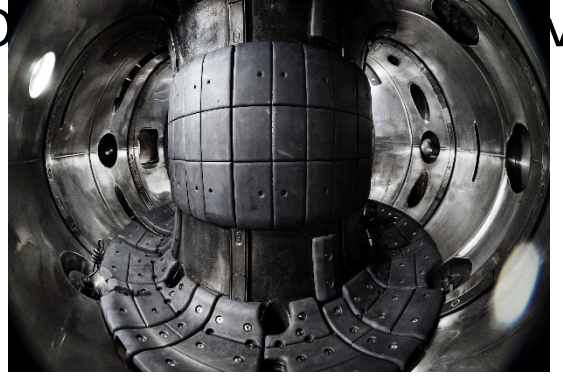
The COMPASS tokamak